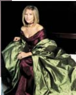
BARBRA STREISAND MILLENNIUM "TIMELESS" CONCERT GOWN Est. $2,000/$3,000

Memorable items from the Arts and Crafts period furniture include, a hammered copper Dirk Van Erp table lamp, two Harvey Ellis-designed Stickley inlaid rockers and an L&JG Stickley china cabinet. Other fine art selections include a painting by Kees Van Dongen, a group of Edward Curtis photographs, and a number of American School floral and genre scenes. Among the other offerings is a selection of Americana furnishings, Art Deco fixtures, Oriental rugs and Native American baskets.