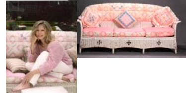
A GROUP OF VINTAGE WHITE PAINTED WICKER FURNITURE Est. $1,500/$2,000

Other highlights include costumes from "Funny Lady," "On a Clear Day," "Yentl," "Nuts," "Prince of Tides" and other productions and public appearances, including a stage-worn concert gown from her 1994 CONCERT tour and a gown from her 2000 TIMELESS tour.