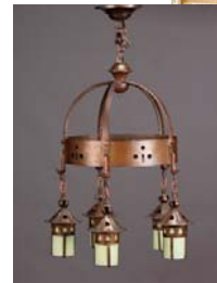
A GUSTAV STICKLEY CHANDELIER Est. $15,000/$18,000