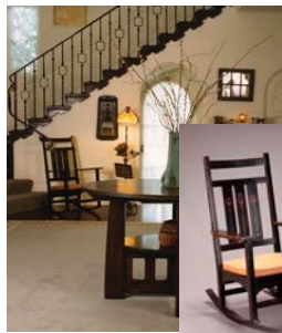
A GUSTAV STICKLEY TALL-BACK ROCKER Est. $12,000/$15,000

Julien's Auctions will auction more than 400 lots from Barbra Streisand's personal collection including paintings, furniture and decorative works of art, memorabilia and stunning stage-worn costumes from television, live concerts and special personal appearances. Among the other offerings is a selection of Americana furnishings, Art Deco fixtures, Oriental rugs, Native American baskets and Barbra's personal Yamaha Baby Grand Piano.