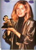
BARBRA STREISAND GRAMMY® AWARDS OUTFIT Est. $1,500/$2,000

impeccable style and pioneering fashion. A variety of Barbra Streisand's clothing and outfits spanning her life and career will be auctioned, including significant items from movie costumes such as her pink robe from "The Way We Were," and ensembles from "Meet The Fockers," to custom Donna Karen and other designer pieces, including two vintage Christian Dior fashions.