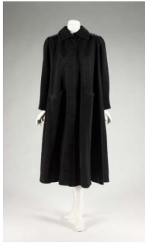
(Valentina Ottoman Silk Overcoat)

Garbo's first American film, The Torrent , opened in 1926 and her entrancing performance made Garbo an international sensation. Here was a woman unlike any other previously seen on a film screen. Audiences became obsessed with Garbo's portrayals of utterly beautiful screen heroines who epitomized the emergence of the modern woman. Many of her films were considered controversial and sexually risqué. Garbo's unabashed sensual qualities and her romantic self-assuredness proved a box office bonanza. As well, Garbo established herself as astute business woman. As a young woman living alone in a foreign land, she battled and even went on strike against her powerful studio bosses. She sought to receive additional artistic control over her film projects as well as compensation commensurate with her rising power at the box office.