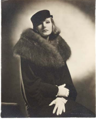
(Vintage portrait Greta Garbo 1932)

Select photographs from Garbo's personal collection of Hollywood studio portraits (often referred to as Garbo's Garbos ) by photographers George Hurrell, Clarence Sinclair Bull, and Ruth Harriet Louise are also part of the exhibit and sale. Furniture, art and décor from Garbo's New York apartment and Garbo's Swedish manor house are also among the highlights. Garbo's artistic talent for design can be seen in many of the sale's offerings. Garbo's colorful rugs featuring modern, abstract motifs were designed by the actress and handmade in the exclusive V'soske workroom. Garbo's bed, which she designed using antique Swedish carvings reflects both her creativity and her affection for her Scandinavian heritage. Also included are very interesting personal books, albums, documents and signed and inscribed items.