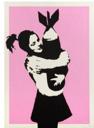
(Banksy "Bomb Love")

The extraordinary Banksy artwork collection, estimated to sell for over $500,000, includes "Happy Choppers" (2002) (Estimate: $100,000-$150,000), an original aerosol stencil of armed military helicopters dressed with a pink bow created in London's Whitecross Street Market; Banksy, "I Heart Boys" (2005) (Estimate: $80,000-$120,000), a large-scale original mural depicting a boy playfully using a paint brush to paint a heart image on a now detached wall of a London residency; Banksy, "Bomb Love" (2003) (Estimate: $25,000-$30,000), depicting a young girl hugging a bomb; Banksy, "Nola" (2009) (Estimate: $25,000-30,000), a signed two-color hand pulled screen print of a girl holding an umbrella with the rain mysteriously falling from inside it, an image Banksy famously used in New Orleans after Hurricane Katrina; Banksy, "Morons" (2006) (Estimate: $20,000-$25,000), a signed artist proof acquired directly from the artist; Banksy, "Crazy Horse" (2013) (Estimate: $60,000-$80,000); stenciled car door installation in New York's Lower East Side during his 2013 New York City month long residency; Banksy, "Stop and Search" (2007) (Estimate: $8,000-$10,000); and Banksy, "Toxic Mary" (2004) (Estimate: $4,000-$6,000).