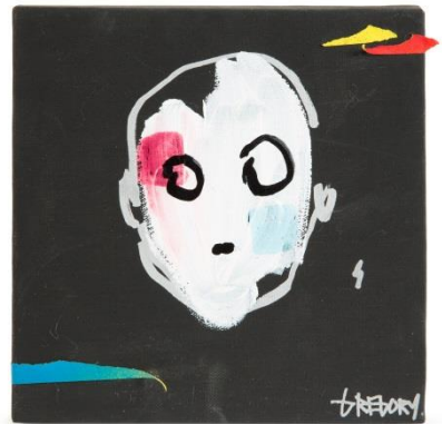
(Gregory Siff "Goodface")