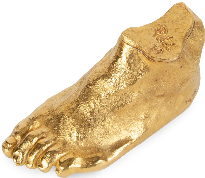
Pelé's personally commissioned 18 karat gold plated bronze foot

on Time's 100 list of most important people of the 20th century, was one of two joint winners of the FIFA Player of the Century and voted World Player of the Century by the International Federation of Football History and Statistics (IFFHS), among many other accolades and honors. The attacking midfielder and forward, who scored a goal in nearly every match that he played, racked a career total of 1,279 goals in 1,363 games and a Guinness World Record for this feat and is the all-time leading goalscorer for Brazil with 77 goals in 92 games. He is also revered as a hero to millions around the world when he became the first Black global sporting star at the 1958 World Cup and for his activism to improve the social conditions of the poor in Brazil and around the world.