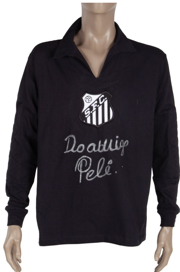
Photo right, Pelé's signed and inscribed Santos F.C. #1 goalkeeper shirts

A sensational collection of nearly 300 sports artifacts and iconic memorabilia will be presented featuring signed and inscribed jerseys and photographs, team shirts, personal wardrobe and more offered directly from the legendary Brazilian footballer hailed by FIFA as "the greatest" of the game. During Pelé's record-breaking career from the 1950s to 1970s, he won three FIFA World Cups (1958, 1962 and 1970)-the only player to achieve this. He was named Athlete of the Century by the International Olympic Committee, included