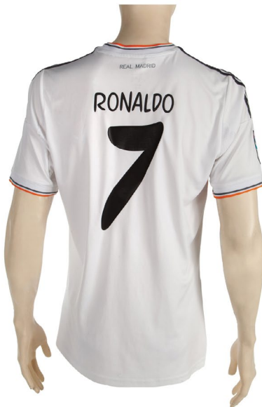
(photo below left to right: jerseys from Cristiano Ronaldo, Franz Beckenbauer, and David Beckham)