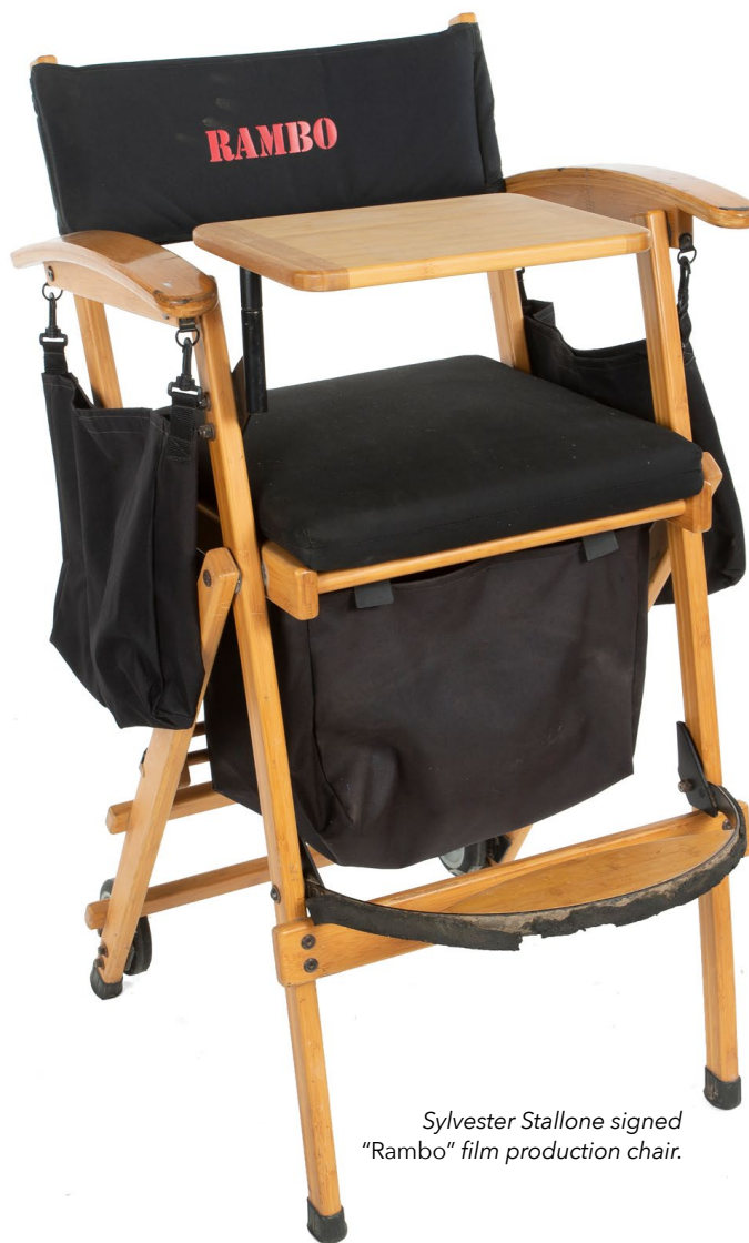
Sylvester Stallone signed "Rambo" film production chair.

(photo bottom left: throwing knives from The Expendables ) Numerous international awards and accolades for