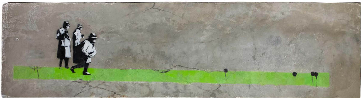
Banksy: Original "Bomb Middle England" mural painting

Sip, Bid and Win: An Evening of Drinks and Art, Street, Contemporary, Pop and Fine Art